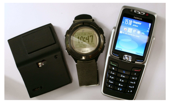
Figure 9. MSP, SPOT Watch, and Nokia E70 Phone used in our system

Location information is primarily gathered through Wi-Fi localization. Our applications only require