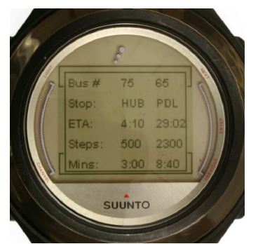
Figure 1. Bus information showing two choices, their arrival times, and the number of steps to their respective stops