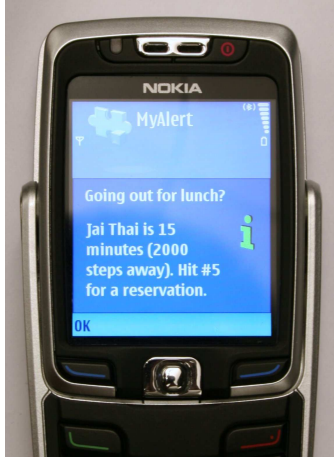
Figure 5. Lunch suggestion which will help Bob meet his goal for the day: an appropriate restaurant a reasonable distance away