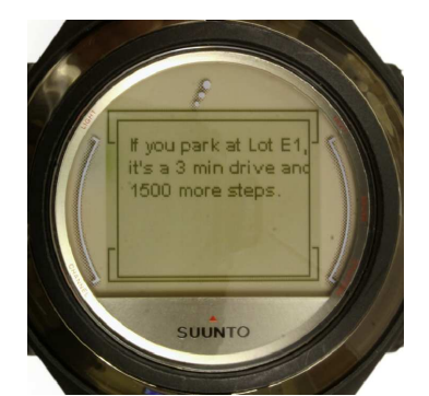
Figure 3. Prompt to suggest a parking location and the steps gained by parking there

Traffic was very light on Alice's commute, so she has extra time to park, and get to her first class. She drives towards the campus building and her watch beeps and displays a message – "If you park at Lot E1, it's a 3 min drive and 1500 more steps." Alice smiles as she turns the car toward Lot E1. Her brother had given her the watch a few days ago to help her meet her goals of 10,000 steps a day. The system knew her location, knew she was driving, and pre-computed step counts to her most likely destination from the different parking options available [13].